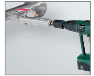
Drill under pressure with the CS drilling jig

By means of the drilling jig, it is possible to drill under pressure through the 1/2" ball valve into the existing pipe. The drilling chips are collected in a filter. Then install the probe as described under 1).