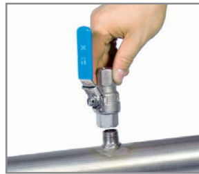
A Screw neck

B Mount spot drilling collar incl. ball valve (see accessories).