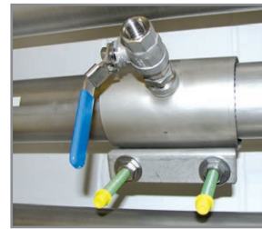
B Spot drilling collars